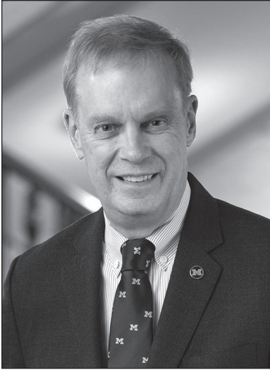
Kent D. Syverud