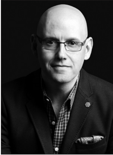
Brad Meltzer Doctor of Laws

Brad Meltzer is an award-winning, best-selling author in five genres — fiction, non-fiction, advice, children’s books, and comic books — and a lifelong champion for the teaching of history. He believes American history is shaped by ordinary people doing extraordinary things, and he has devoted his life to telling their stories. A first-generation college student, he graduated from the University of Michigan with a B.A. in history (1992). His first novel, written while in law school, was rejected 24 times. His second novel, The Tenth Justice , became a New York Times best-seller within a week. He has written 13 novels for adults — historically informed legal and political thrillers set in Washington D.C. — and all have been best sellers. Amid the danger and intrigue, ordinary characters take heroic action. He has written 38 children’s books, including 33 in the acclaimed kids book series, Ordinary People Change the World , also known as the “I Am” books. Each book introduces children to a real-life hero — I Am Abraham Lincoln , I Am Frida Kahlo , I Am I.M. Pei — and explores the hurdles they faced, including issues of identity and culture not often found in children’s literature. When